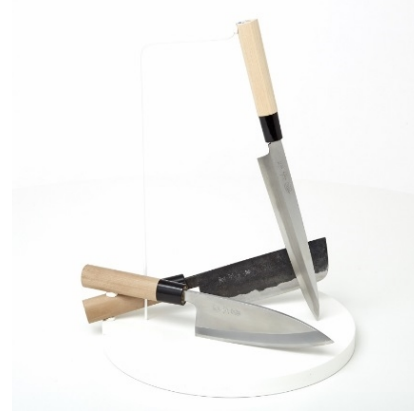
Photo: Set of Japanese kitchen knives showing a 'Deba bōchō' in the foreground, used to chop fish or meat, a square-bladed 'Nakiri bōchō' for vegetables and a 'Yanagi-ba-bōchō' used to make sashimis.

In certain cases, preparation techniques may be subject to particular rules belonging to particular cultures. An example of this would be the technique for cutting up raw fish in Japan.